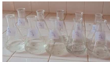
Figure 2. Samples of ash solutions.

filtrate obtained into wells previously rinsed with the solution and on which the number of each sample is written from S 1 to S 10 .