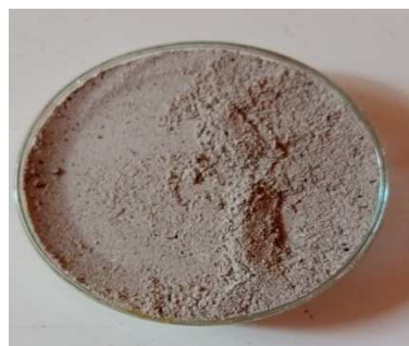
Figure 3. A sample of ash.