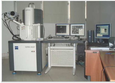
Figure 5. Photo of the SEM FEG Supra 40 VP Zeiss Scanning Electron Microscope.