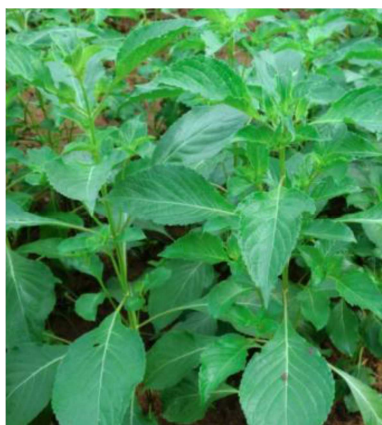
Figure 1. Plant of the Ocimum gratissimum L.

Our study was carried out on leaf ash of Ocimum gratissimum L. The leaves were collected in July 2019 from four sites in the central region of Benin and six sites in the southern region.